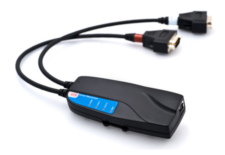
Kvaser Memorator HS/SWC