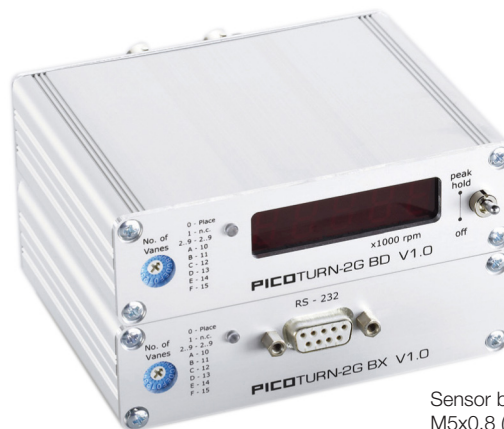
Signal Conditioning Box with display Ref. PT2G-BD